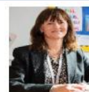
Sixth Form Pastoral Coordinator Year 12/13