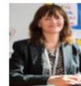
Sixth Form Pastoral Coordinator Year 12/13